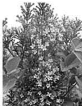
TINKERBELLE LILAC Syringa 'Bailbelle'